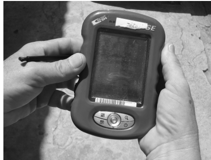
Fig. 3. Field use observation: the device under the sunlight has legibility impaired.

operation of the application in order to avoid slowdowns, crashing or other technical issues that may impact usability.